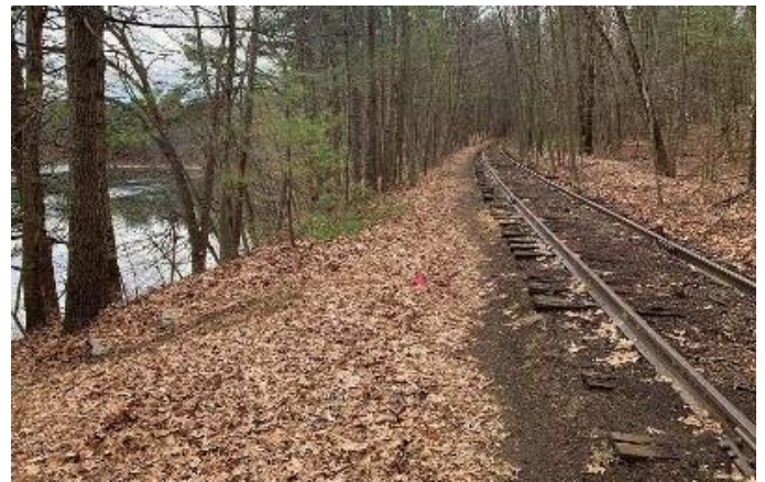
Construction past White Pond in Concord began in January.

The southern-most half-mile of the trail in Concord (Powder Mill Road south to the town line) is under construction as part of Phase 2D in Sudbury. Work on this section began in January with clearing of vegetation, followed by installation of erosion control barriers and removal of rails and ties. The contractor expects the project to be completed in 2024.