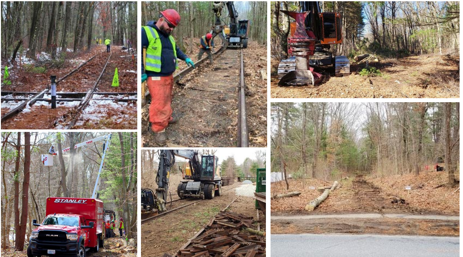
Clockwise from upper left: First day of clearing, Jan. 23, looking north from the diamond. Removing rail spikes south of Morse Road. The diamond has been removed and is preserved nearby. Rails removed north of Old Lancaster Road. Rail removal equipment and rail remains north side of Hudson Road. Tree removal work in progress south of Old Lancaster Road.

The BFRT will be an intra-town and inter-town connector for schools, municipal buildings, athletic fields, parks, the commercial district, and houses of worship. Most of all, it will connect friends and neighbors in a safe, natural setting, drawing people out of their homes in all seasons for exercise and recreation. You’ll be able to leave your car in the garage and get out on the rail trail.