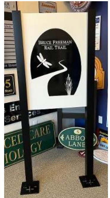
The dragonfly logo sign, provided by the Friends, will be installed at the new pocket park in Chelmsford center.