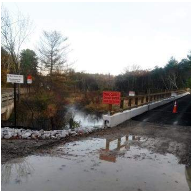
...but the "people-life" trail is still under construction. After 20 years, please be patient for a few more months and stay off the trail until construction is complete! This photo of the up ramp for the Great Road (Rte. 2A) overpass shows some of the hazardous conditions.

By the end of December, most construction activities on this phase will be complete. Then management of Acton's newest recreational resource will transition to the Town. A public ribbon-cutting ceremony is planned for the spring.