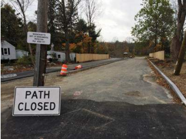
Construction on the Assabet River Rail Trail near the South Acton Train Station

The trail is scheduled to open in May 2018.