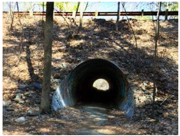
The new tunnel at Powder Mill Road was completed at the end of August, replacing the old corrugated steel tube. The new tunnel was painted this fall. Work continues on the ramp from the road to the trail. Landscaping is expected to be installed in 2018. A 360-degree view of the tunnel is available here: http://bit.ly/2gEjgph .