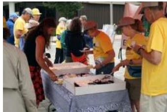
And of course, there was cake!

Although this phase is not scheduled for completion until spring 2019, signs of progress can be seen from various intersections along the trail. Rails and ties were removed last spring and summer, and erosion barriers were installed. The Powder Mill Road culvert/tunnel was replaced during July and August, with construction completed in time for the start of the new school year (photos on next page). The Assabet River Bridge, a pre-fabricated steel structure, was installed in September (photo right).