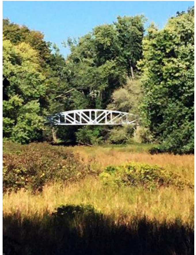
The new bridge over the Assabet River in West Concord was installed in September. It is not yet open to the public.

Please note: The trail is an active construction zone, and it is unsafe to enter.