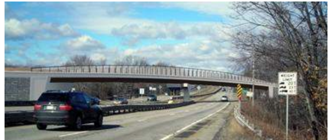
MassDOT rendering of proposed 300-foot bridge over Rte. 2