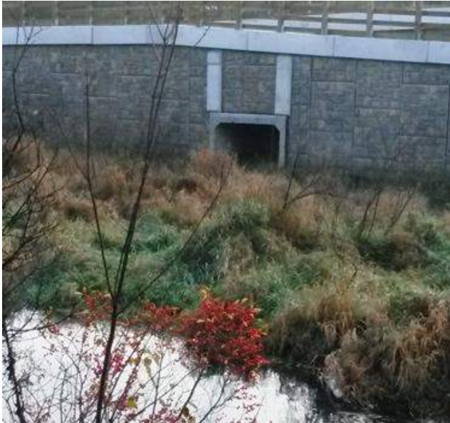
The wildlife tunnel, which is part of the the Great Road (Rte. 2A) overpass ramp, opened for use in November...

Construction of Phase 2A of the BFRT, including most of Acton plus small segments in Westford and Carlisle, has progressed significantly over the past six months. Although the trail has been partially paved, it is not open and is unsafe to use until it is formally opened next spring. The entire length of the project is an active construction area and has ongoing, changing conditions common to construction sites. The hazards may include: drop-offs, loose construction materials, incomplete road crossings, incomplete signage, unstable piles, sharp objects, partially installed railings and fencing, holes for planting or posts, service vehicles and debris. In addition, during the fall and early spring, the contractor will be installing many live plants, which need time to settle without being disturbed.