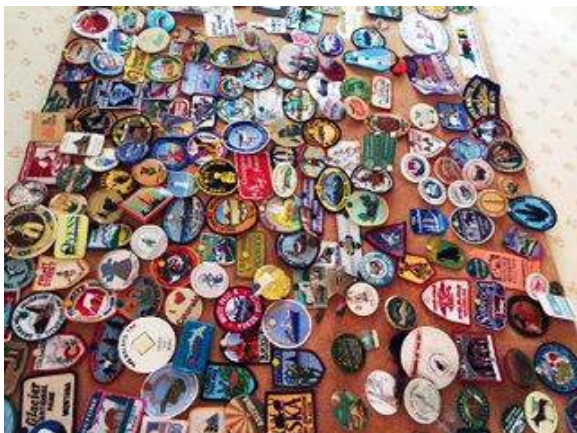
A display of some of the patches and pins May and Bert collected to commemorate their many trips.

Although Bert recently passed away, May has wonderful memories of their many bicycle adventures.