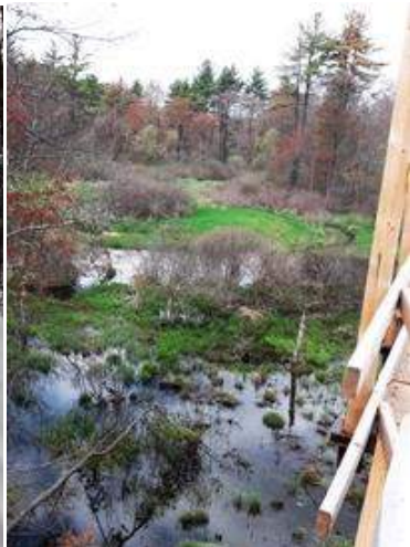
Nashoba Brook at spring flood, from new Great Road bridge.