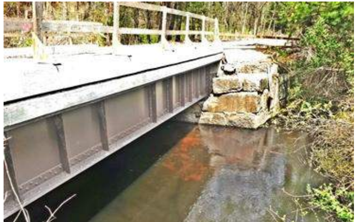
Phase 2A Bridge being restored. Original riveted steel beams with native cut granite piers and new concrete top shade Nashoba Brook (see Phase 2A, next page).