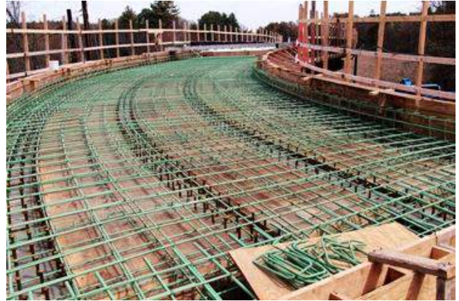
Re-bar in place on the curved bridge over Great Road (Rte. 2A).

After two construction seasons and a winter's hibernation, construction resumed this spring on the 4.9-mile extension of the trail through Westford, Carlisle and Acton. SPS New England Construction Site Manager Brad Lubenau discussed recent progress and upcoming plans. Brad noted that he has already conducted several project walk-through site reviews with Acton Conservation personnel, resulting in some changes to erosion control barriers.