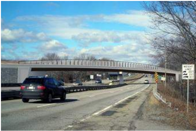
MassDOT rendering of proposed 300 foot bridge over Rte. 2

Work on the next design phase of the BFRT Phase 2B is expected to begin this spring, once a contract has been awarded to the selected consultant. Phase 2B connects the trail between Acton (Phase 2A) and Concord (Phase 2C) over Rte. 2. This section of the trail begins at the intersection of Wetherbee Street and Great Road in Acton and continues across Rte. 2 to Commonwealth Avenue in Concord. The total project length is approximately 1.04 miles. The project includes replacing a bridge over Nashoba Brook, building a new bridge over Rte. 2, and creating a new culvert for a wildlife crossing under Rte. 2.