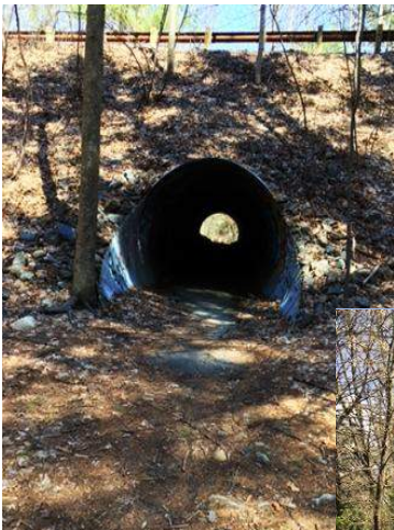
The contractor expects to replace this old culvert under Powder Mill Road with a new, larger, culvert this summer.

Come celebrate the many years of engineering, design and waiting in Concord at the groundbreaking ceremony this spring for Phase 2C. Information about the groundbreaking will be available at http://bit.ly/Phase2c-gb . Local and state officials will join MassDOT and the Friends to kick off this two-year construction project. Light refreshments (think cake!) will be served.