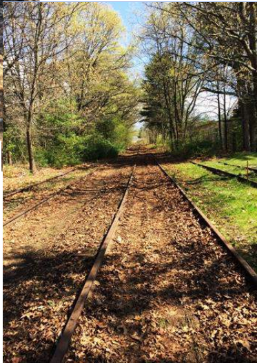
The trail is already being cleared on Phase 2C in Concord in preparation for upcoming rail trail construction.

MassDOT awarded the $6.7 million contract for Phase 2C to D.W. White Construction earlier this year.