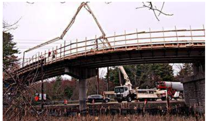
Pouring concrete for the new bridge over Great Road (Rte. 2A)

New decks were installed on all six of the historic bridges crossing Nashoba Brook. First, the historic native-cut granite piers were extensively cleaned. Then the riveted iron beams were cleaned and repainted. Then a third beam was fabricated and installed on each bridge. Finally the deck forms were put in, and concrete was poured.